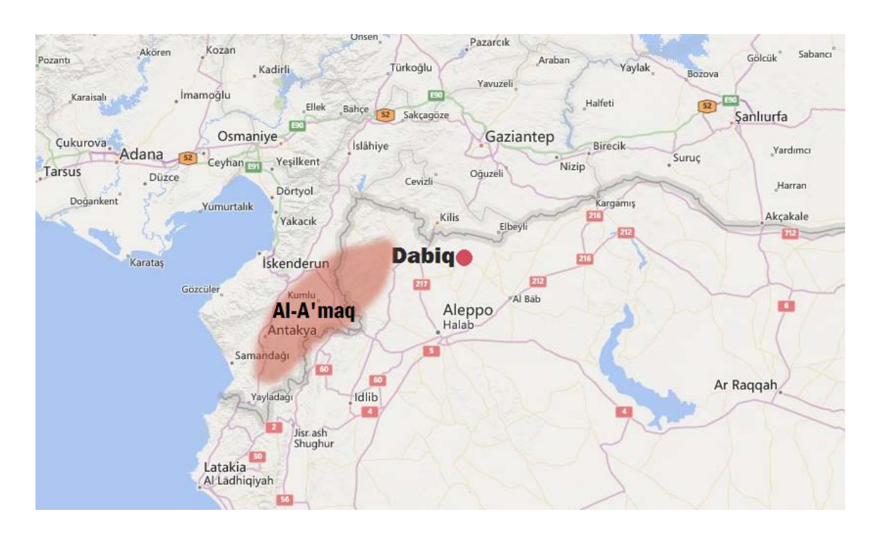
A map showing the location of Dābiq and Al-A'māq

Some have suggested that Al-A'māq is actually in Yemen or in some other place, due to there being similar areas around the world which are flat and surrounded by mountains. Sure enough, if we include every such geographical area there could arguably be 1,000's of areas which may be possible candidates for being the area mentioned , however in the context of the ḥadīth it seems quite clear that Al-A'māq is the area almost directly next to Dābiq. It would seem to be very unlikely that Dābiq would be mentioned when it has an area known as Al-A'māq right next to it, yet when Al-A'māq is mentioned that it would refer to any area but the Al-A'māq area right next to it.